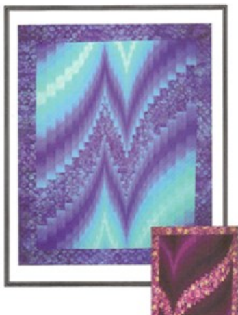
Two Fabric Bargello