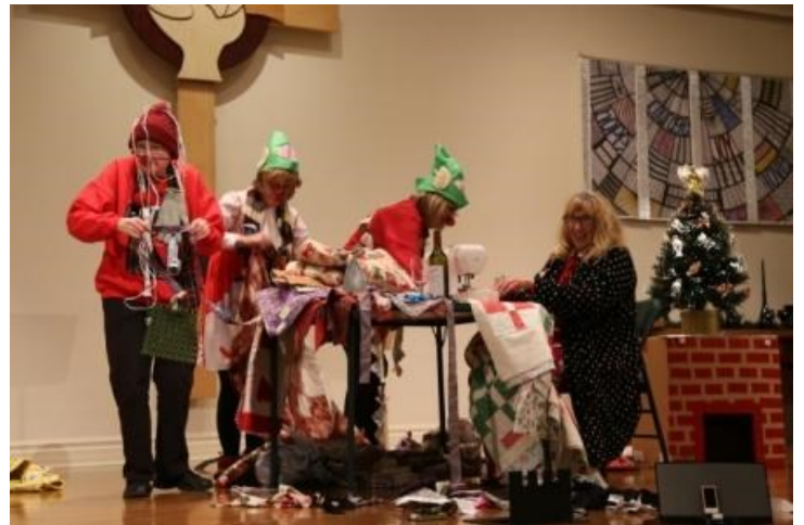
A flurry of activity to help the distressed quilter.