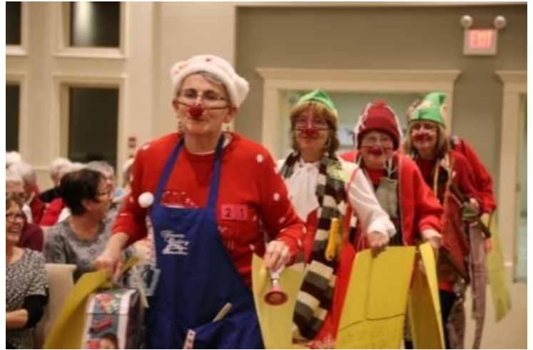
Quilters Rescue Team on their way to save the day!

Life is like a Quilt - Years bound together, Embellished with family and friends. Backed with tradition, stitched with love, With cornerstones placed carefully. To create a one of a kind Journey through time.